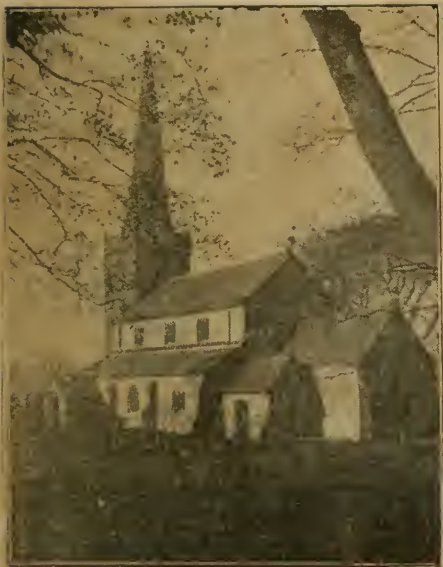
THE CHURCH ATTACKED BY BEES.—HUGGATE, | YORKSHIRE.